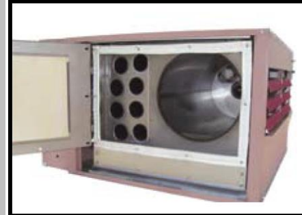
Full Swing-Out Rear Door for easy, quick, complete cleaning