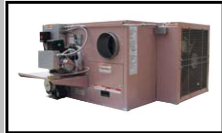
Fan Unit Heaters

As the factory authorized sales, service & warranty outlet for major brands of equipment in Manitoba, Saskatchewan & N.W. Ontario we stock numerous parts & accessories. Check with our service department when your equipment needs repairs.